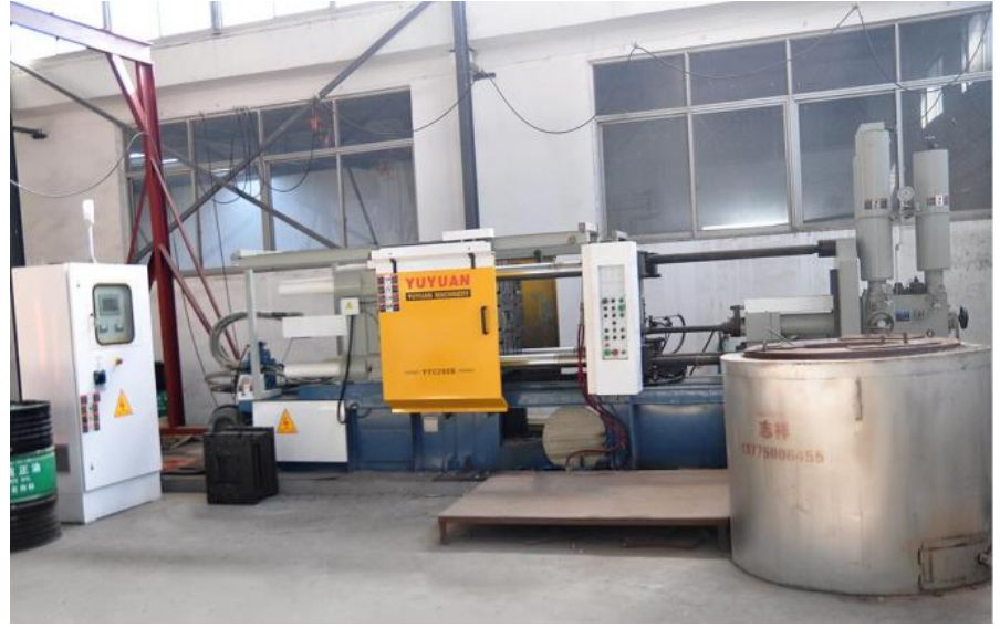
C&A Industrial Component Ltd

Our manufacturing facilities are located in Zhejiang area and Jiangsu area with a USA sales office for our North American Customers.